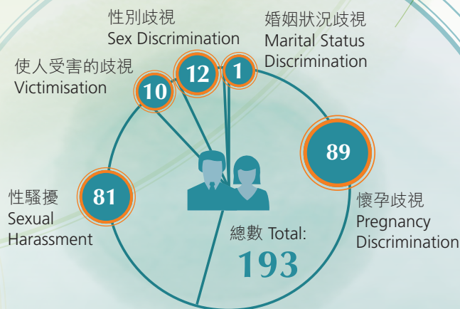
(表二 Figure 2)

在193宗涉及僱傭範疇的性別歧視投訴中，大部分投訴與懷孕歧視和性騷擾有關。 The majority of the 193 employment-related SDO cases were related to pregnancy discrimination and sexual harassment.