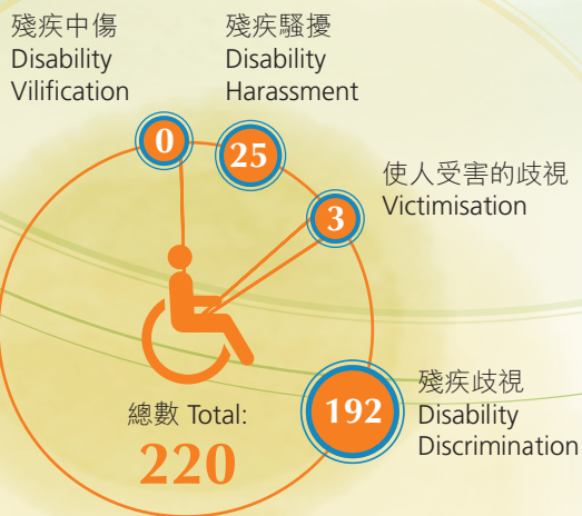
(表一 Figure 1)

在220宗涉及僱傭範疇的殘疾歧視投訴中，大部分與病假和工傷有關。 Most of the 220 employment-related DDO complaints involved sick leave and work injuries.